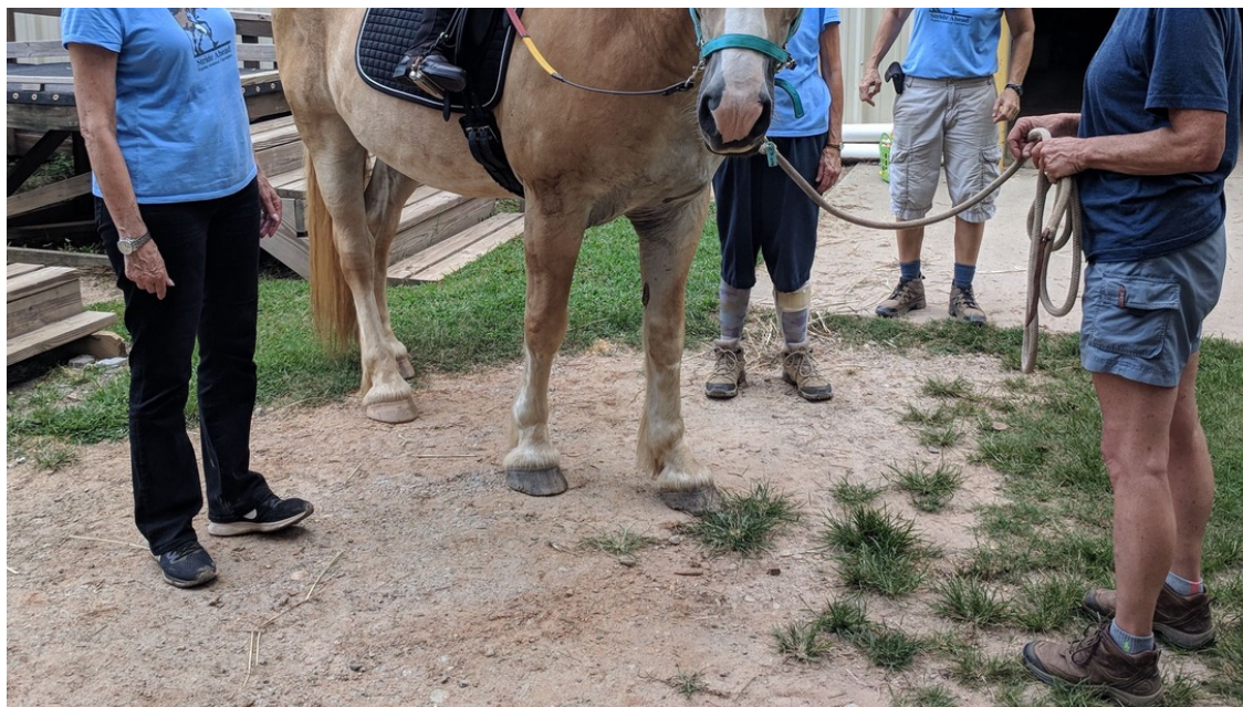
Finn's first therapy session.