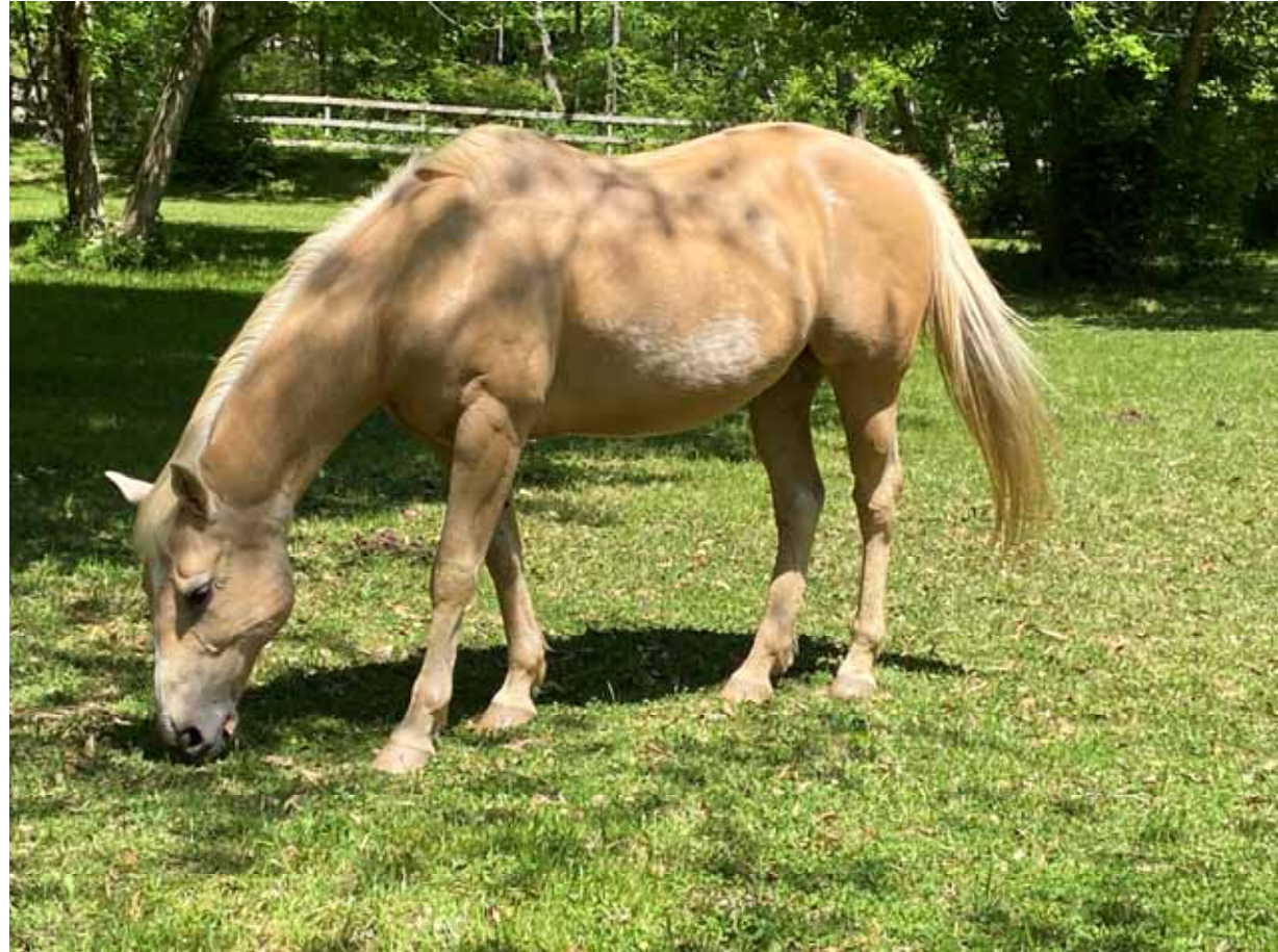
Nash: Stride Ahead's newest