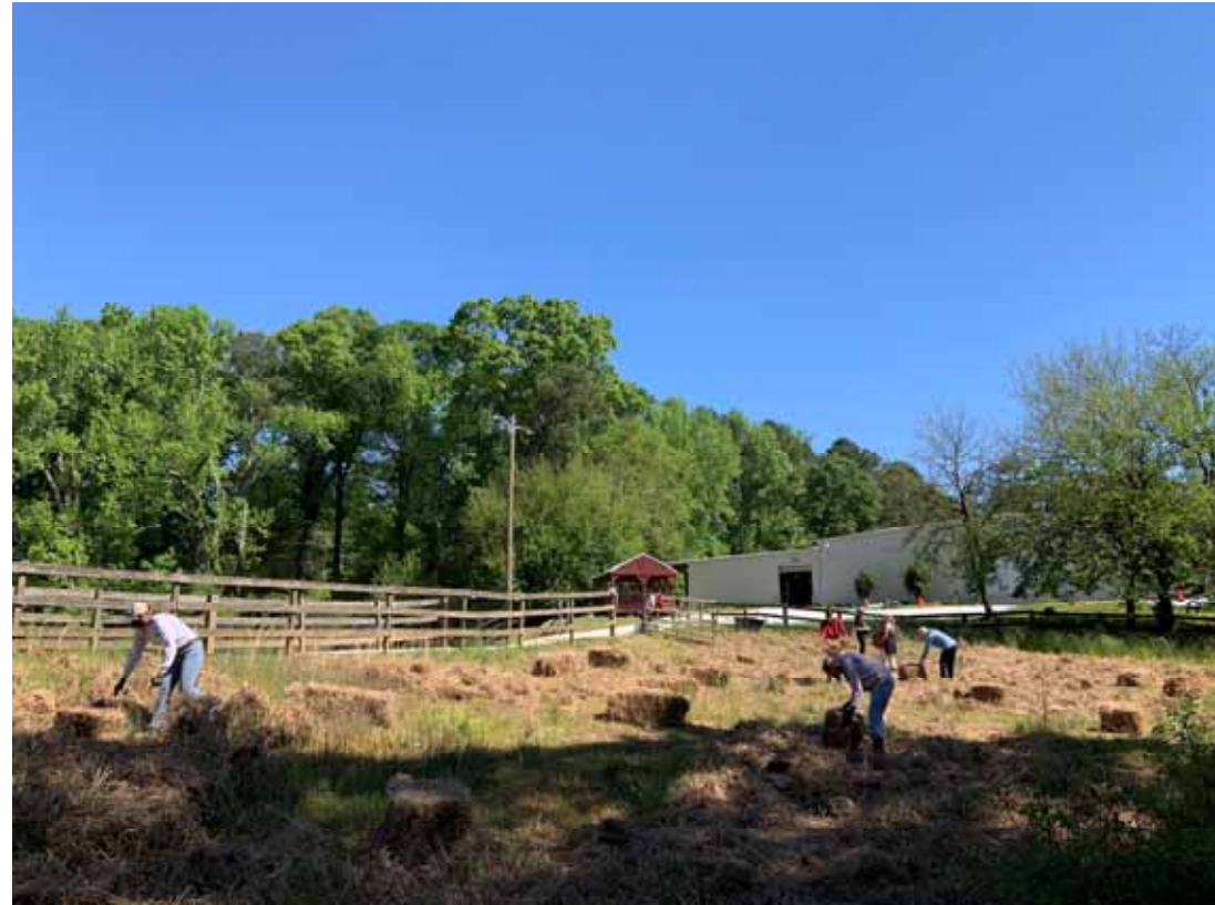
Readying the Audubon Bird Sanctuary

LCFC is dedicated to keeping the Park's community informed. Check us out!