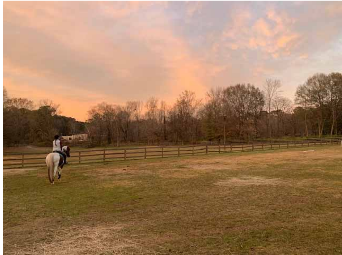
Sunset over the grass arena