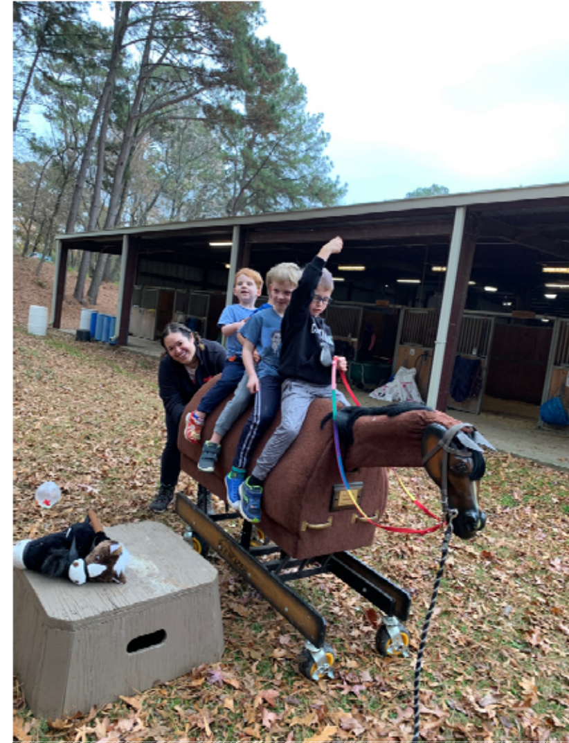
He had "the best birthday party ever"