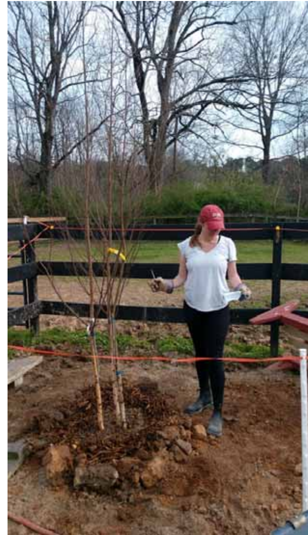
Trees Atlanta planting Spring 2021