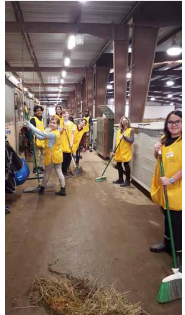
Pony Crew at work and play

Pony Crew is currently full! Look for information coming soon on about joining the crew in the future.