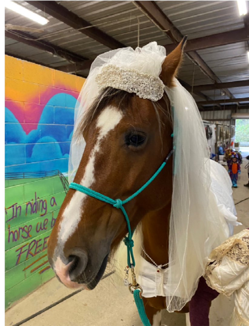
Believe in her bride's costume