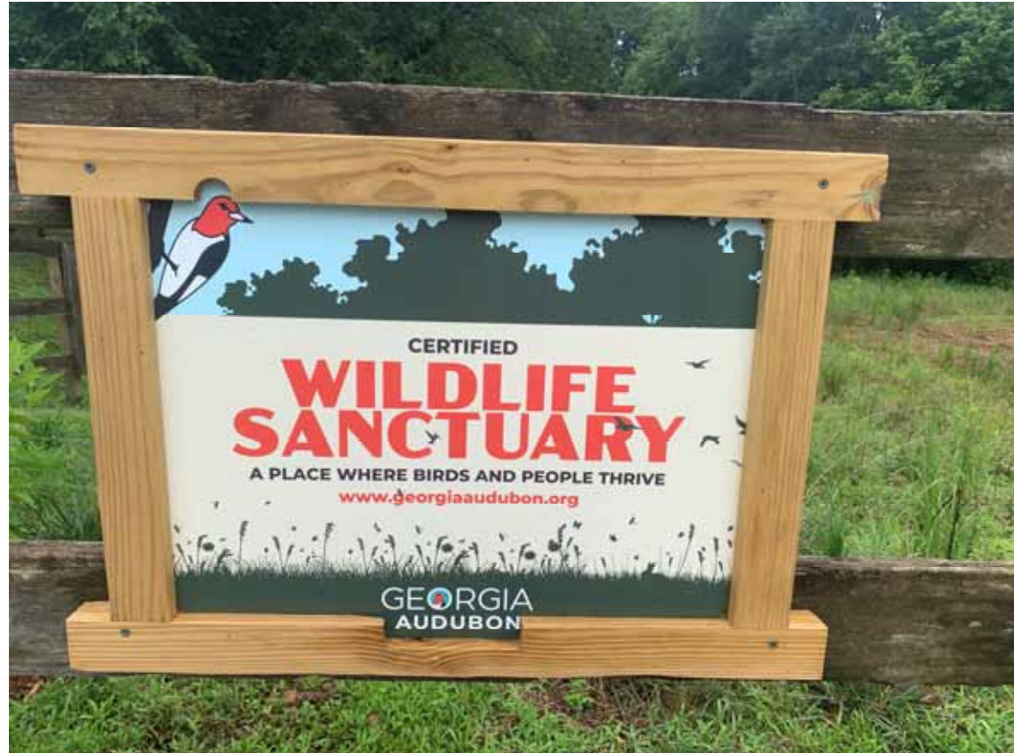
Newly certified Audubon Wildlife Sanctuary restoration

Little Creek joined a network of certified wildlife sanctuaries across Georgia to counter the loss and degradation of wildlife habitat.