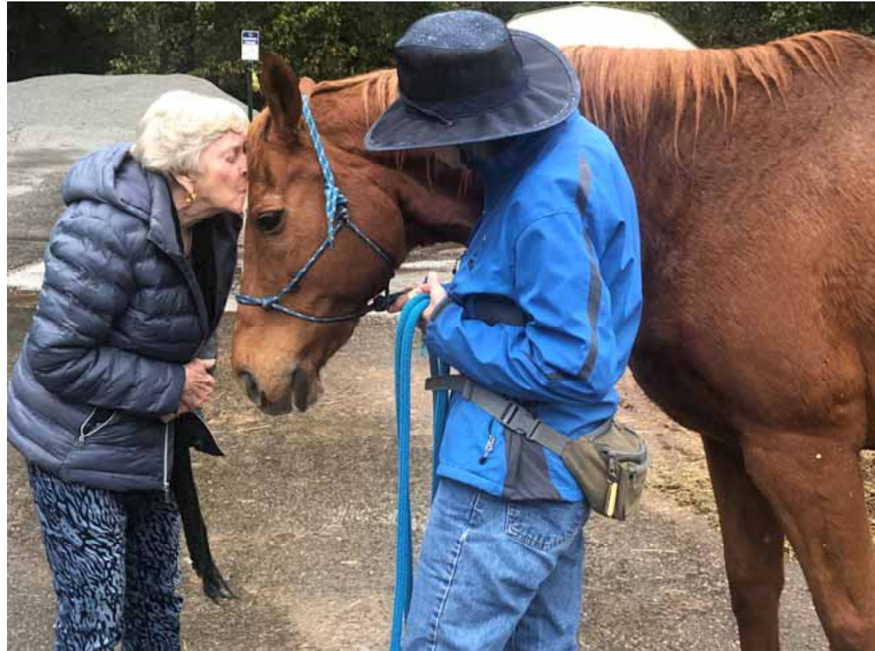
Al shares the love

www.littlecreekfarmconservancy.org/handsonhorses