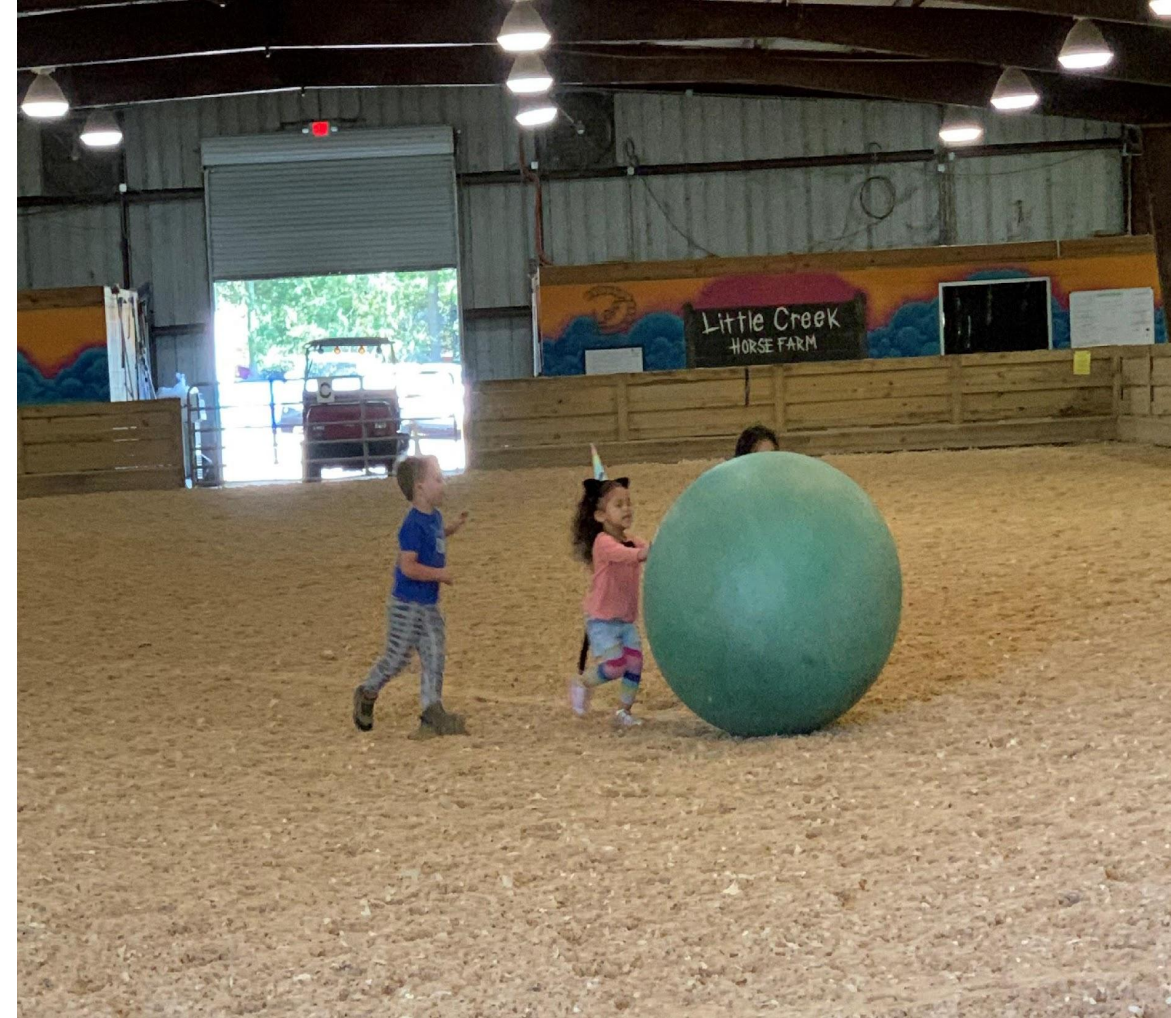
Exploring the horse's world

https://littlecreekfarmconservancy.org/parties/