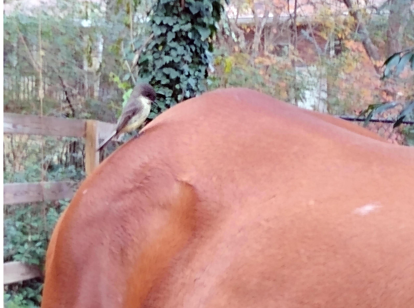
Al and Eastern Phoebe

DeKalb County installed a security gate that was part of the original grant as a direct park improvement. This allowed Park Pride and LCFC funds to complete the new community access facilities.