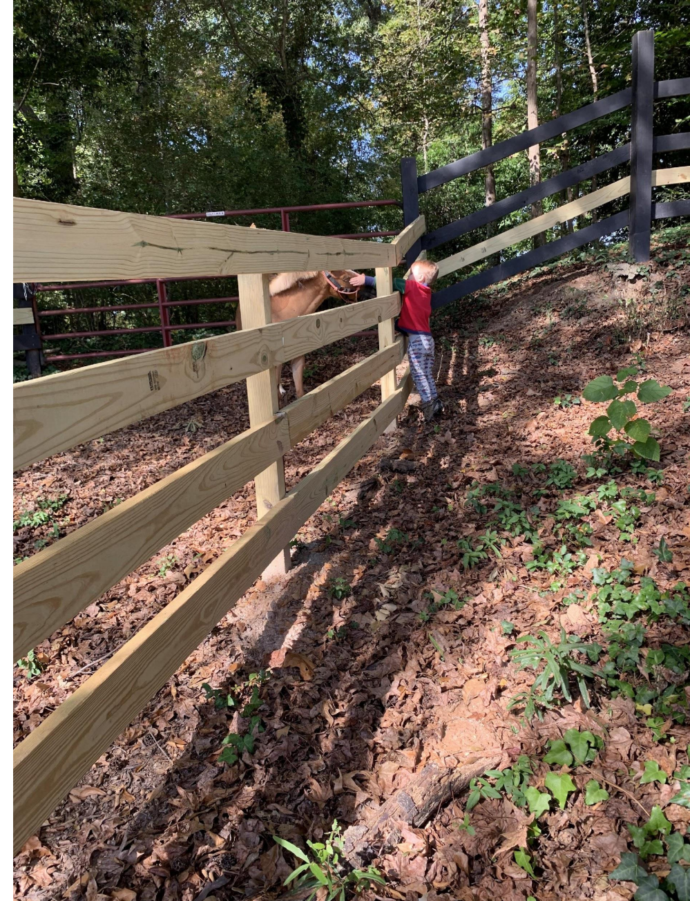
New friends – future equestrian

Riding Lessons are provided through Mark's Riding School and Atlanta Riding Academy while Equine Assisted Therapy is provided by Stride Ahead. For information: www.littlecreekfarmconservancy.org