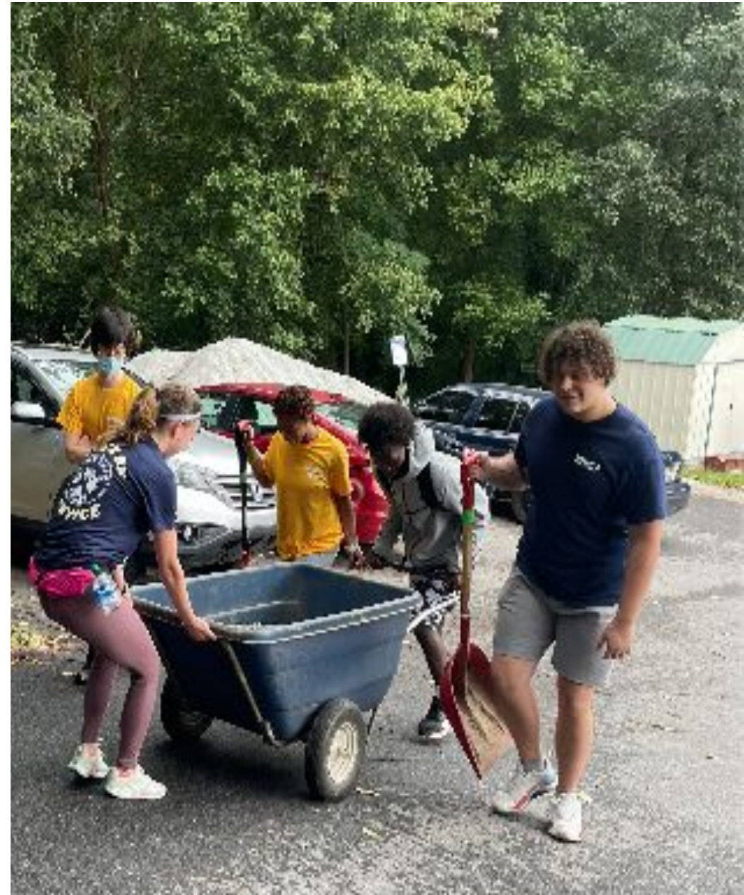
Emory Day of Service volunteers bring gravel to improve a pedestrian walkway - thanks!