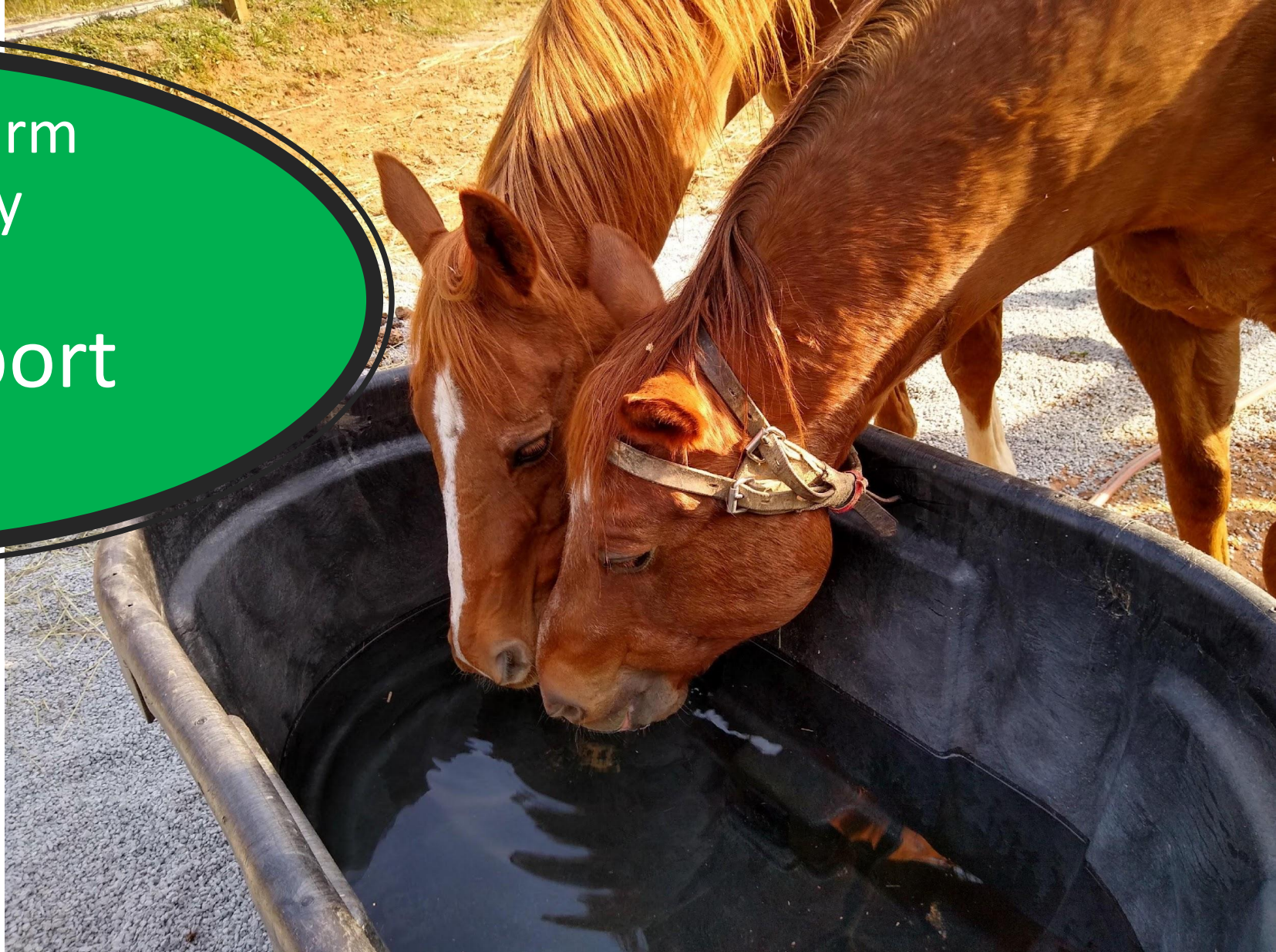
Drinking buddies at Little Creek