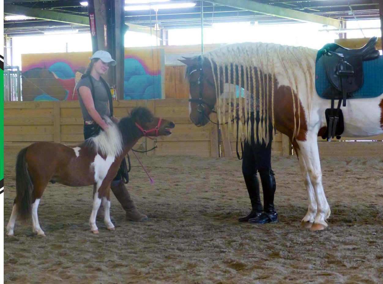
Boone “clacking” to Believe – “I’m just a baby, protect me”

For program and other information: www.littlecreekfarmconservancy.org