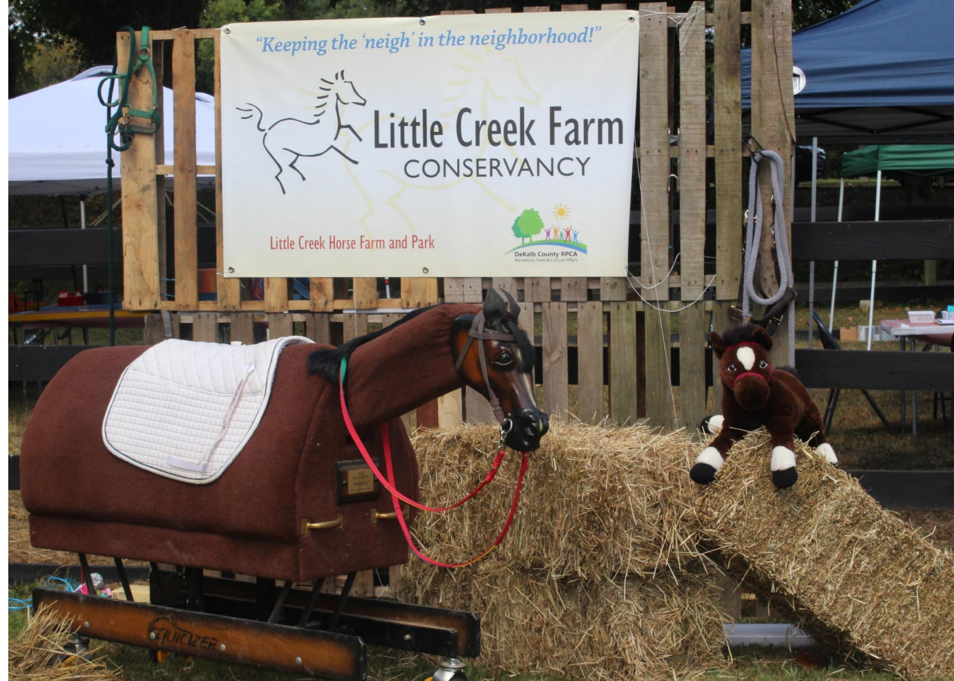
Photo booth with Wallee, our training horse