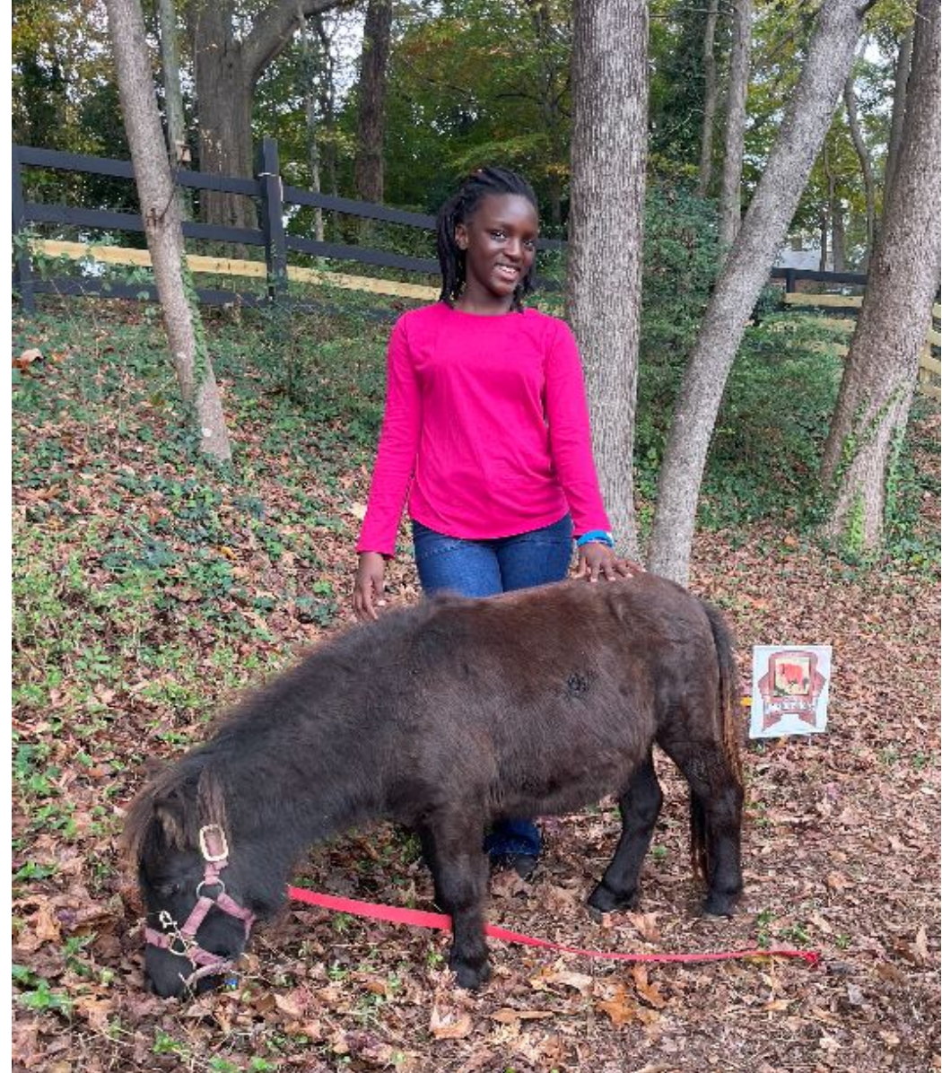
Joy at the petting zoo – pony ride days

In 2022, LCFC completely redesigned its Pony Ride program. The new format includes pony rides, petting zoo and crafts. With the new format, the Conservancy plans to offer pony rides to the community 3 times in 2022 and plans to expand the program in 2023.